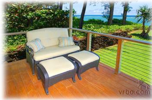
30 ft. Plantation Style Family Deck; Cozy Nook Reading, Whale Watching.....