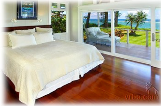
The Blue Lagoon offers 2 Ocean View Master Suites (Suite1) Interior Ceiling fan