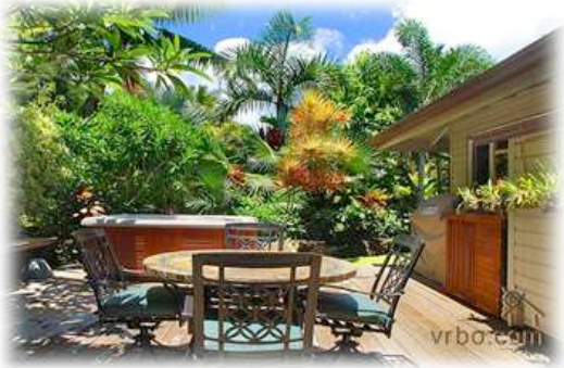
Entertain on Side Deck Jacuzzi, BBQ, Outdoor Shower & Sound System Much more....