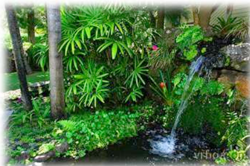
The Kio pond is the backdrop for relaxing in the hammocks and lower bedroom