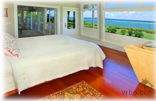
Master Suite(2)Ocean View includes In-Room AirConditioner +180 degree Ocean View