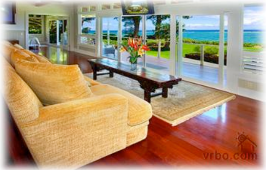
Interior Living Room, Extra deep (7) person Couch excellent for Rainbow viewing