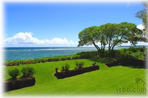
View from your Deck looking East towards Princeville~ miniture golf set up