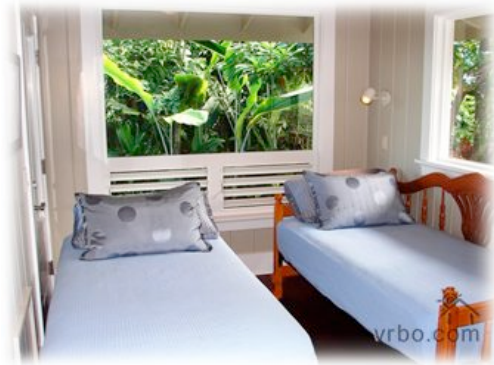
3rd bedroom alternate set up: 2 twins or 1 Day bed/couch Photo shows smaller