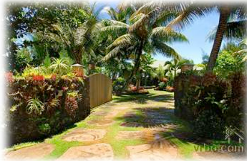
Coded Gate Entry, Volcanic Rock Wall w/live Orchids & variety of Tropicals - Haena, Kauai Vacation Home Rental