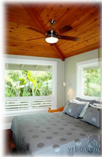
3rd bed room partial ocean view optional set up:King or (two) twins or Day bed