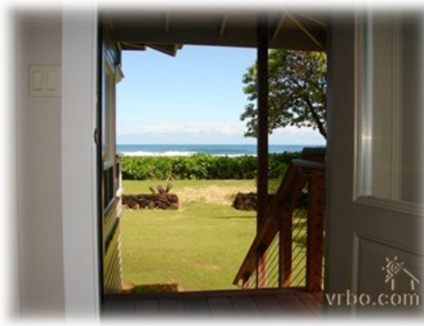
3rd bedroom main floor ocean view, private access & direct beach access