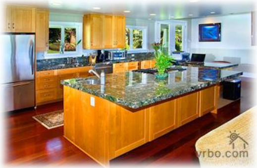
Custom Kitchen Stainless Kitchen Aide Appliances Gorgeous Marble Counters - Haena, Kauai Vacation Home Rental