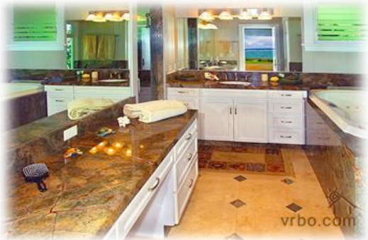
Master Suite(1) Bath Jacuzzi Tube(R) Marble Shower(L) Private Rest Room(R)