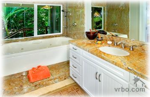
Master Suite(2)Bath Ocean View from Jacuzzi Tube includes Private Rest Room