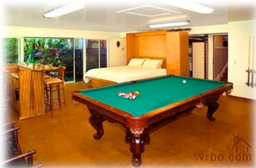
Water fall Suite (4) Cal.King Murphy Bed newly added Queen Futon/couch