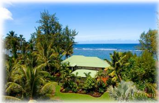
5 Star The Blue Lagoon North Shore Kauai, Aerial View, Secluded Reef - Haena, Kauai Vacation Home Rental