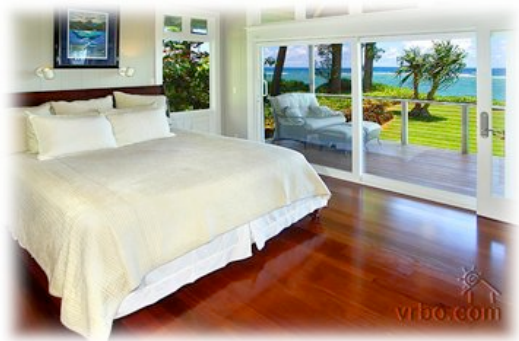
The Blue Lagoon offers 2 Ocean View Master Suites (Suite1) Interior Ceiling fan

Haena, Hawaii Vacation Rental by Owner Listing 146004